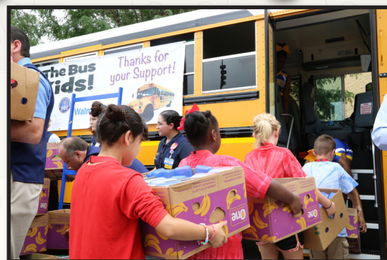
Students help load school supplies onto a bus at the Valley View Walmart during the kickoff of the 2016 Load the Bus for Kids campaign.

Every year, thousands of students across the Roanoke Valley can't afford basic school supplies to be successful in the classroom. Roanoke County Public Schools has teamed up with Walmart and other area school systems to Load the Bus for Kids to collect school supplies for students in need. In 2016, the Load the Bus campaign was the most successful ever in Roanoke County collecting an estimated $17,500 worth of school supplies. We would like to thank Walmart for their continued generous support of our school system and we also would like to thank the countless number of people to donated school supplies. Thanks to your support, many students in the Roanoke Valley began the school year with the tools they need to be successful learners.